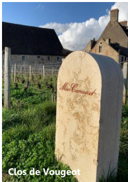
Clos de Vougeot